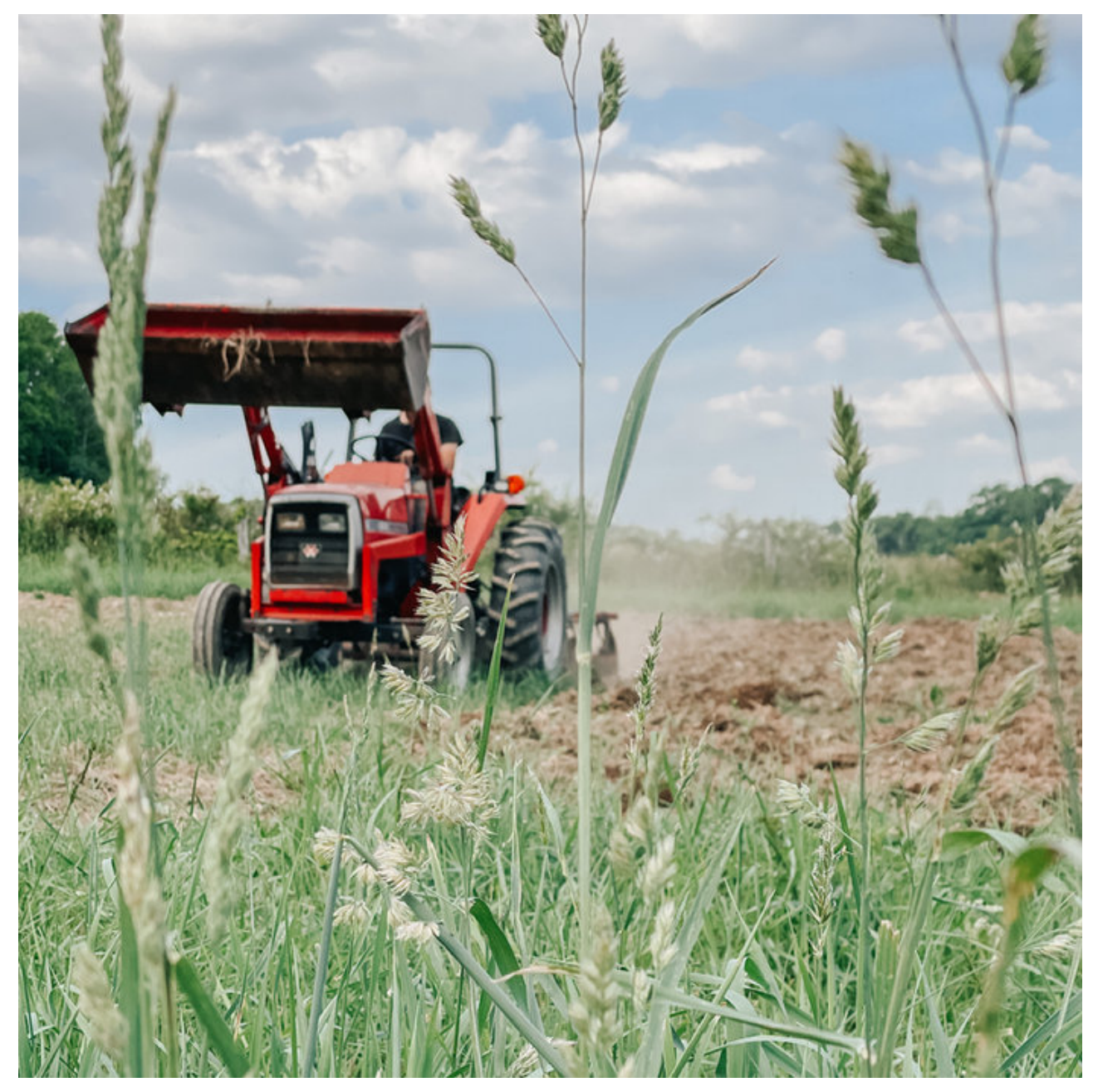
Again, ignore the heavy equipment above, and let's stick to the very basics, shall we?

By now, you should know exactly where you want to grow your flowers so it's finally time to get down and dirty, no matter what growing zone you find yourself in.